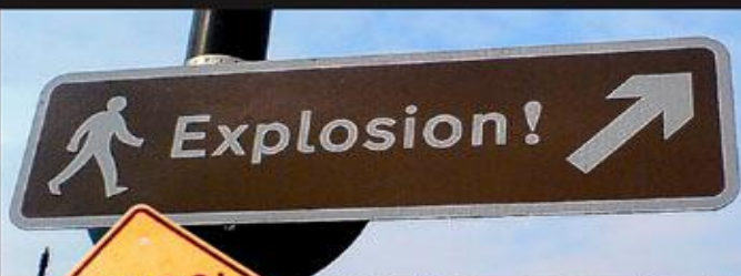
Look out for fireworks in Gosport, Hampshire