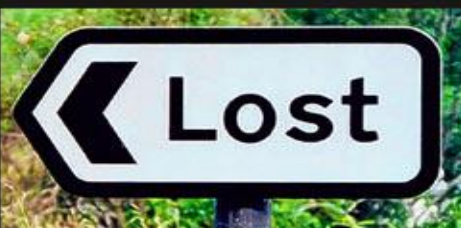
This hamlet is somewhere in Aberdeenshire, Scotland

Please do not Annoy, Torment, Pester, Molest, Worry, Badger Harry, Harass, Hackle, Persecute, Irk, Rag, Vex, Bother, Tease, Nettle, Tantalise or Ruffle the Anima