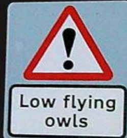
You might have to duck in Portishead, near Bristol