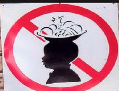
Fruit hats are banned in KwaZulu Natal, South Africa

WARNING TO TOURISTS DO NOT LAUGH AT THE NATIVES