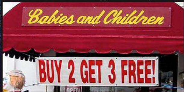
Instant family in Roanoke, Virginia, U.S.A