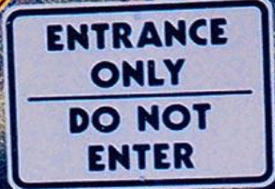
Confused? You will be in Pennsylvania, U.S.A